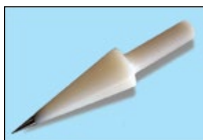
2" Cone Roller