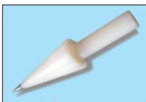
3" Cone Roller