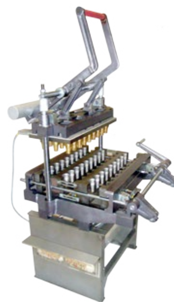
Special Edition-ZE 50 Plus

* The capacities indicated above are maximum values. The exact capacity depends on baking time, recipe and cone size etc.,