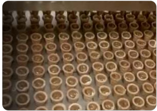
2nd Cream Dispensing View