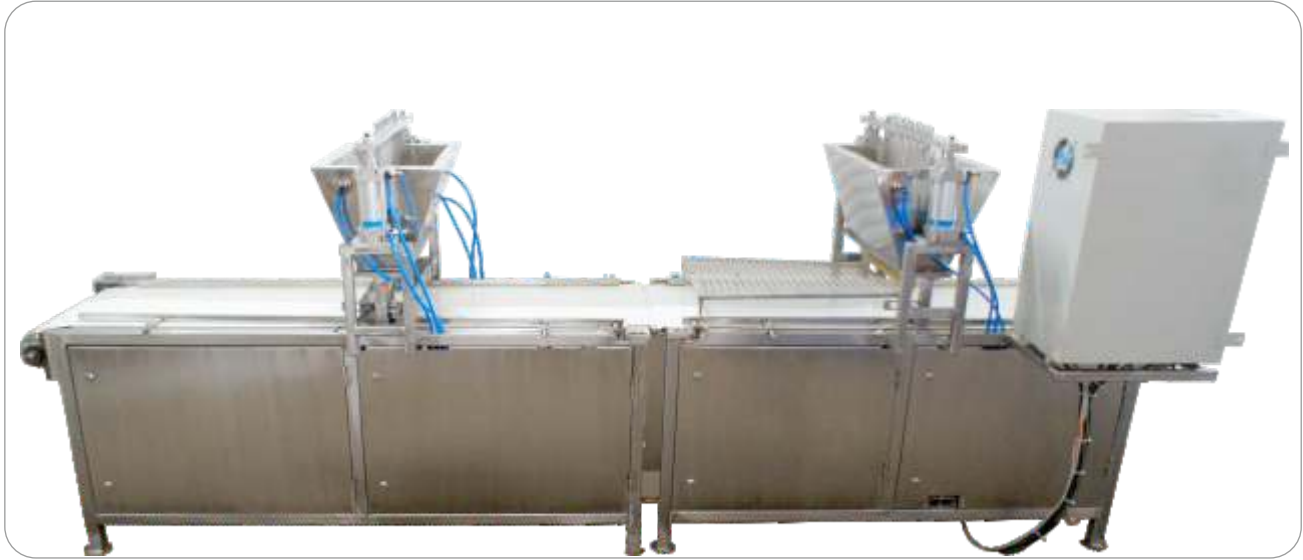
Semi Automatic Cone Filling Machine