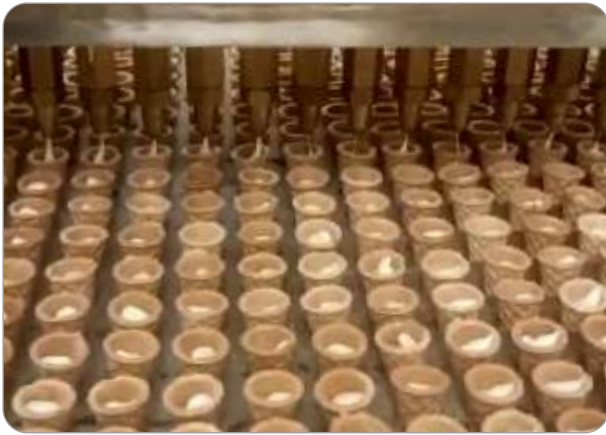
1st Cream Dispensing View